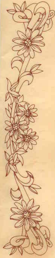
Tube 3 blue outlines